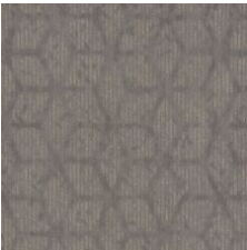
Major Milestone 77515