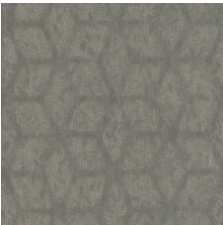
Self Reflection 77484